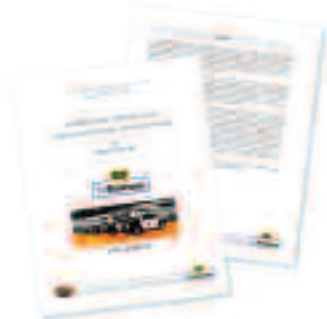
Technology recommendations are documented in plain language.