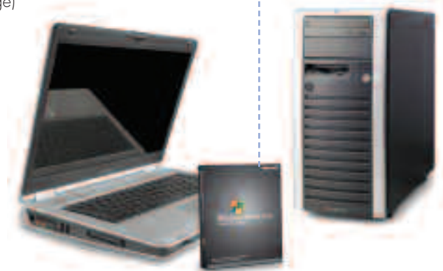
Wide assortment of brand-name products.